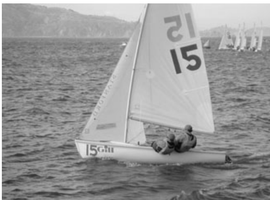
Since 1991, SMCM Sailing has won 11 national sailing titles.