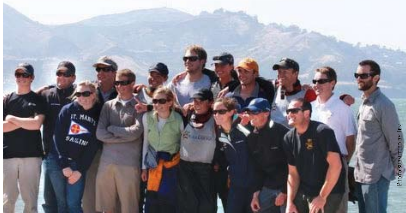
After 36 races against schools such as Yale University and Georgetown University, the SMCM Sailing team won the ICSA Coed National Championship in San Francisco.