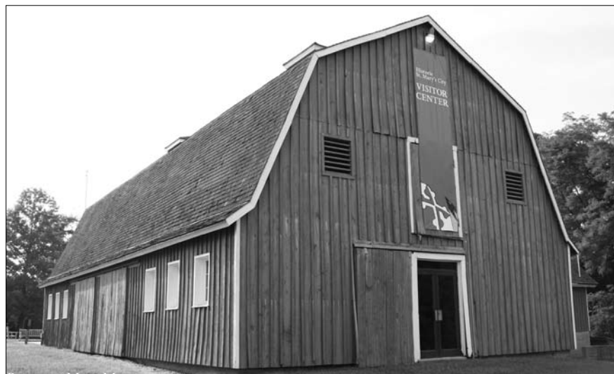
The proposed Maryland Heritage Interpretive Center will replace the current HSMC Visitor Center located off Rosecroft Road.